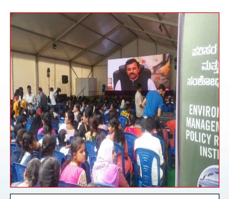
Participants watching Documentaries & Videos on various environmental issues

EMPRI setup an exhibition stall at the "Plastic Ban & Alternative to Plastic" event organised by Bhruhat Bengaluru Mahanagara Palike (BBMP), at Freedom Park, Bengaluru from 12th september to 14th september. Banned plastic items, alternative to plastics and exempted plastic items were showcased in the exhibition to create awareness on plastic ban. EMPRI also distributed various hand-outs on waste management rules, banned and alternative to plastic items, books on air pollution and "Save lakes" children books to create awareness on environmental issues. EMPRI Staff members also had interactive session with public & school children on various environmental issues. EMPRI also spoke to media regarding effects of plastic pollution. Documentary films on climate change, plastic ban, sustainability and other environmental issues were shown to the participants. More than 10000+ people including school, college students, government, private employees, NGOs and general public convened from across the city.