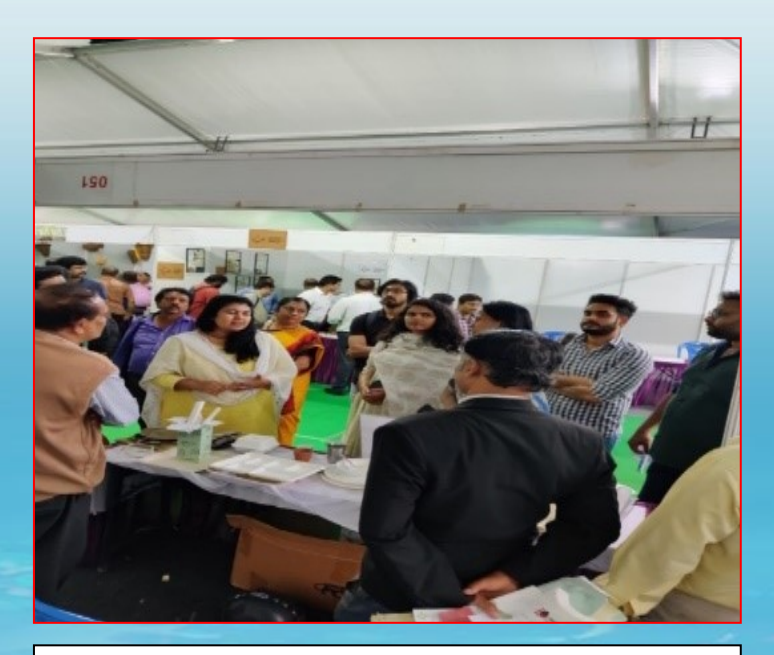
Jaynagar MLA Sowmya Reddy at EMPRI stall at Freedom park, Bengaluru