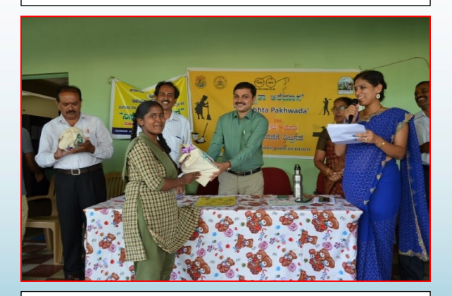
Prize distribution to the winners of competitions