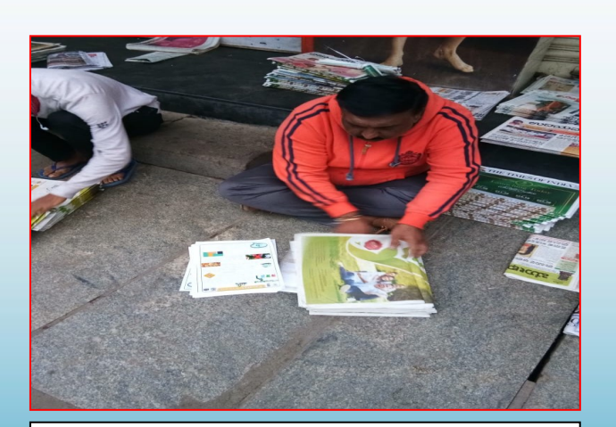
Distribution of flyers on "Duties of waste generator" from solid waste management rules-2016 as newspaper inserts.

From August 1st to 31st August, EMPRI organized "Dust to Dust Bin" campaign to create awareness among households and public to promote waste management and waste segregation at source. EMPRI printed flyers on "Duties of Waste Generator" from solid waste management rules-2016, Government of India. These flyers were distributed among general public in public places by EMPRI staff members. Flyers were also distributed to households as newspaper inserts in residential areas of J P Nagar, Bengaluru. 1000+ membrs are participated.