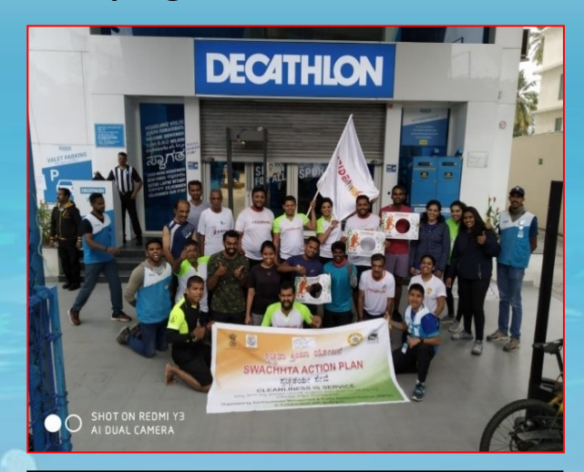
Distribution of Flyers to public at Decathlon, Brigade road.

On 31-08-2019, EMPRI in association with Chronic Foundation organized a marathon at Decathlon Eva mall, Brigade road Bengaluru to create awareness on cleanliness. Flyers on "Duties of Waste Generator" was distributed to morning walkers and general public at Halasur Lake road and Brigade road to promote cleanliness drive. Workshop on eco-friendly Ganesha idols was organized. 200+ people participated.