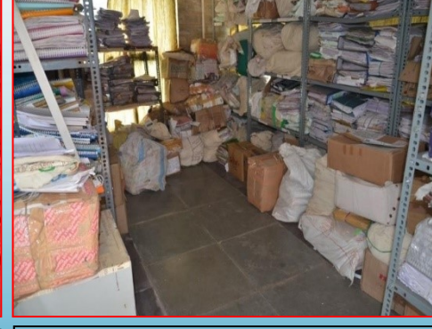
After cleaning of office premises