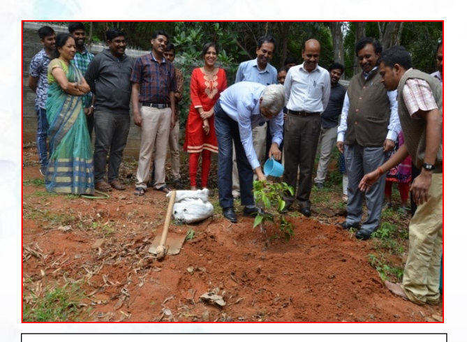
Plantation by Director General of EMPRI

On 29<sup>th</sup> July 2019, plantation drive was conducted at EMPRI, Doresanipalya campus. Rare species of plants were planted at EMPRI campus by Director General, Director & staff members of EMPRI. 75+ staff members participated.