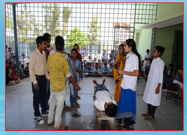
Performance of drama by students on Swachh Bharath